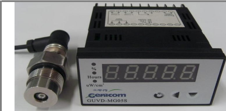
Fig. 1 UV Radiometer 5.0 (Size of Display : 97 × 50 × 112mm)