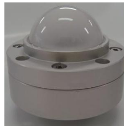
H3 Sensor Probe