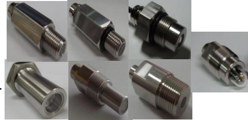
LW Probe Series