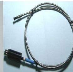
LO Probe(High Temp)