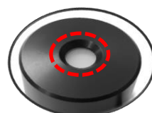
UV Detecting Sensor